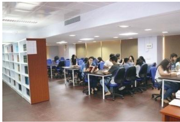
Library Reading Hall

initiated bi-annual journal is published regularly.