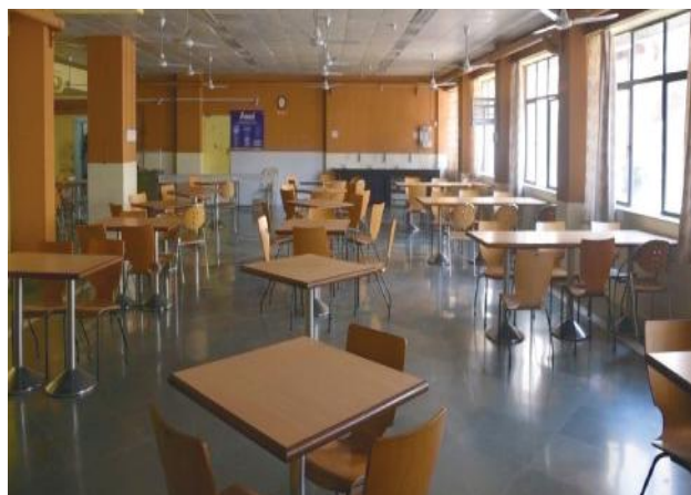
Hostel Dining Hall

has attached washroom and a spacious balcony.