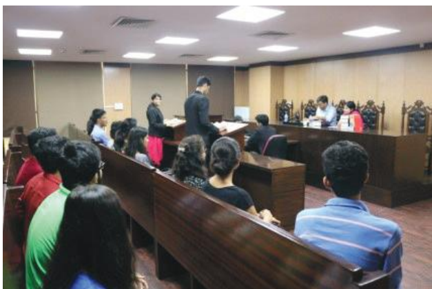
Moot Court Hall