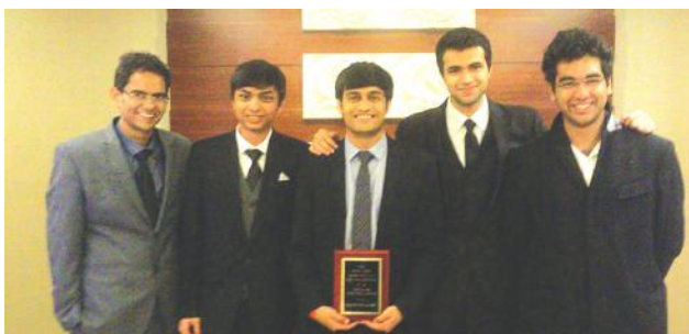
National Winners of Jessup Moot 2017

of the 34th BCI Moot Court Competition, 2017. They have won a host of citations including Best Memorial for finals. Participants were adjudged as best Female Advocate as well as best Speaker for Final Rounds & as best Male Advocate and Best Speaker for Third Round.