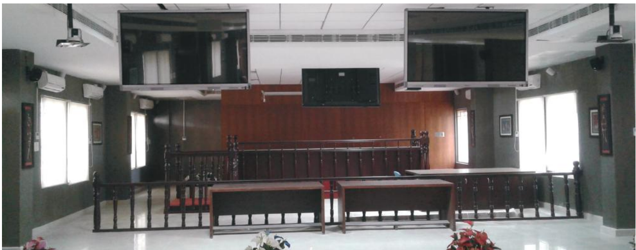
Moot Court Hall