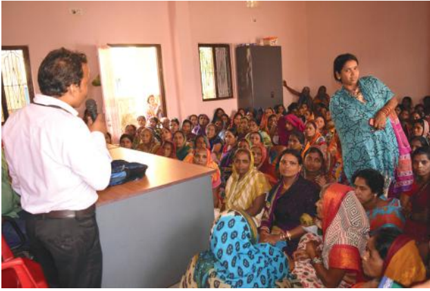
Legal Aid Clinic under Access to Justice (UNDP Project)