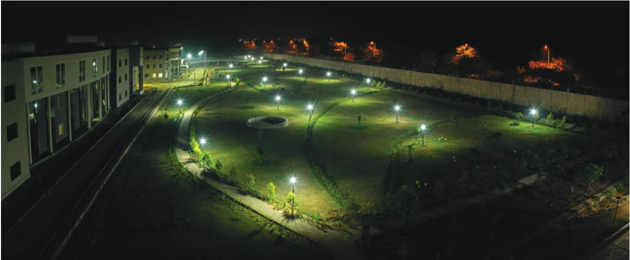
Night view @ NLUO

We have emerged as centre of excellence through the following well defined course of actions: