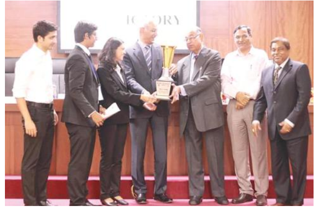
Maritime Arbitration Moot Court Competition

Project in Higher Education in the State of Odisha would examine the reasons for pendency of cases and find out the common legal issues.